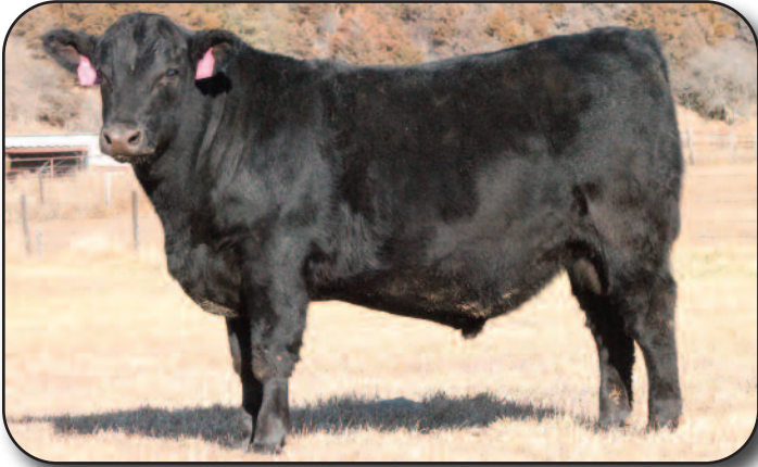
LOT 6 - MSAR Who's That 4197

All these calves carry their mother's rib and thickness.