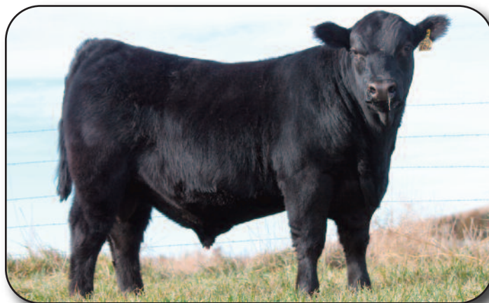
LOT 62 - MSAR Cash 3267