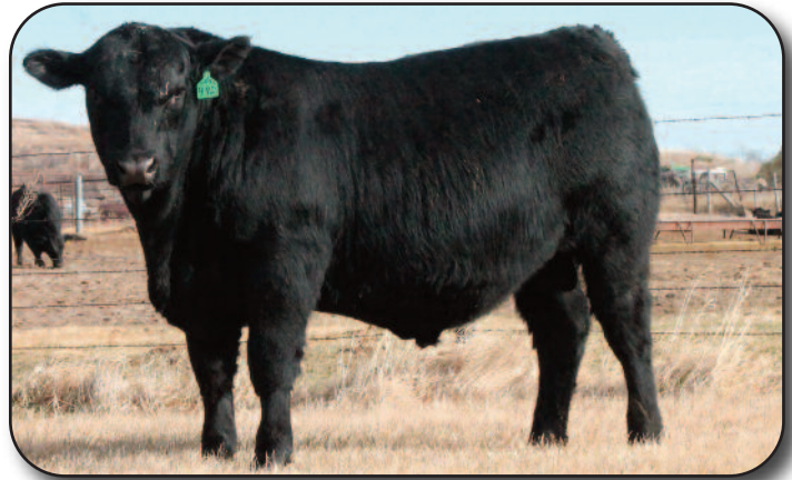
LOT 30 - Simonson Who's That 2237