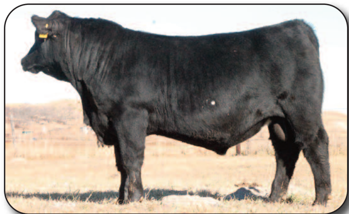
LOT 49 - MSAR Arsenal 3627