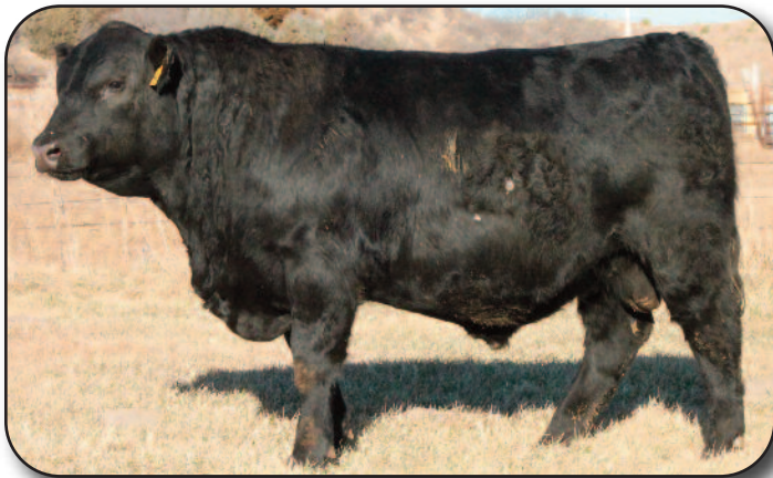
LOT 36 - MSAR SAV Resource 3387