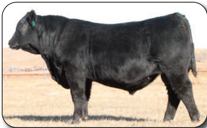
LOT 1 - Simonson Who's That 1167