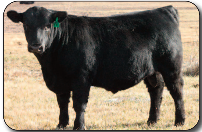
LOT 98 - Simonson Top Seep 1847