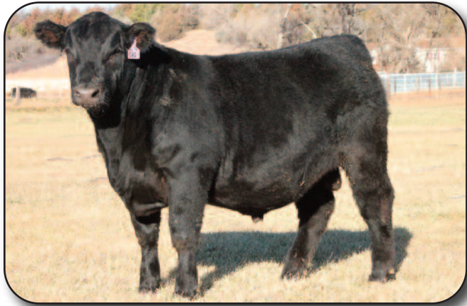
LOT 87 - Simonson Rising Son 1317