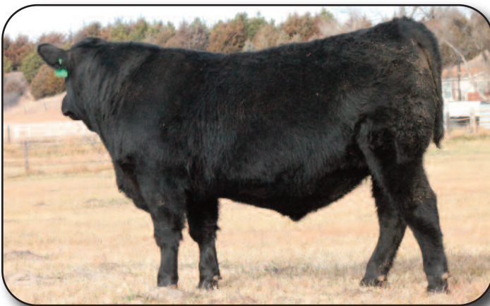
LOT 80 - Simonson Roughrider 2147