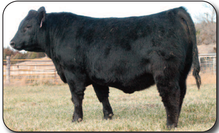
LOT 90 - Simonson Rising Son 1627