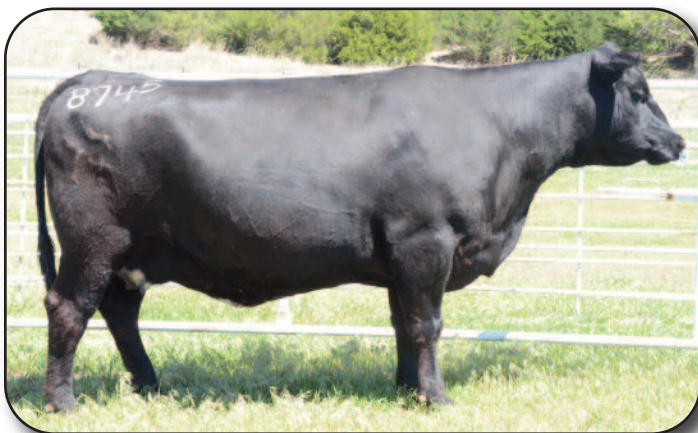
Donor Dam • MSAR GD Blackcap 8745

Progeny are lots: 13-17 65, 66, 110, & 111