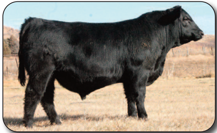
LOT 69 - MSAR Traction 3837