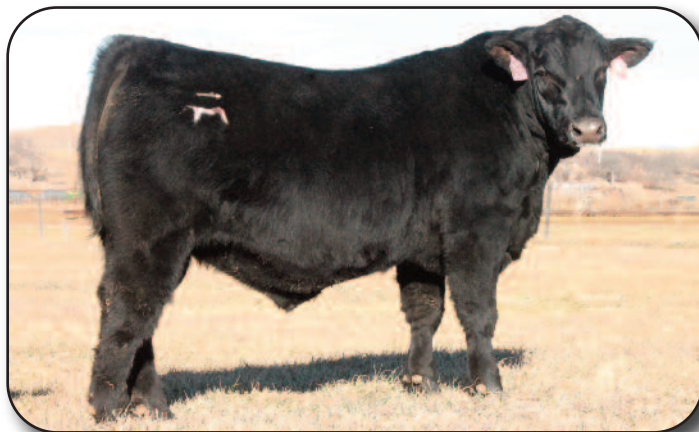
LOT - MSAR Who's That 4147