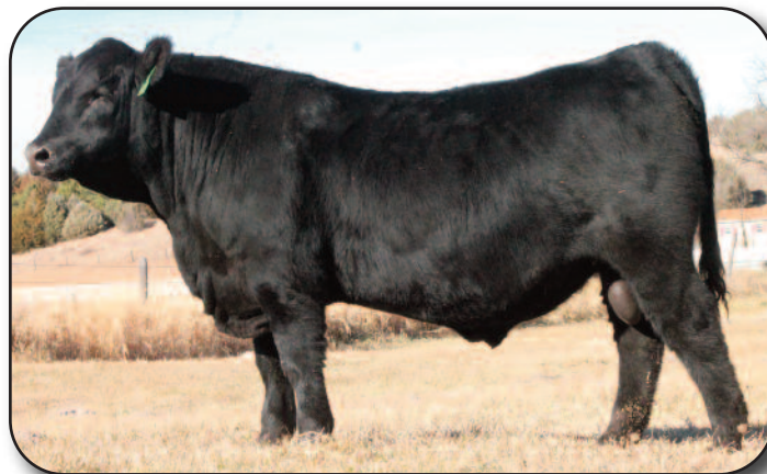
LOT 41 - Simonson SAV Resource 1897