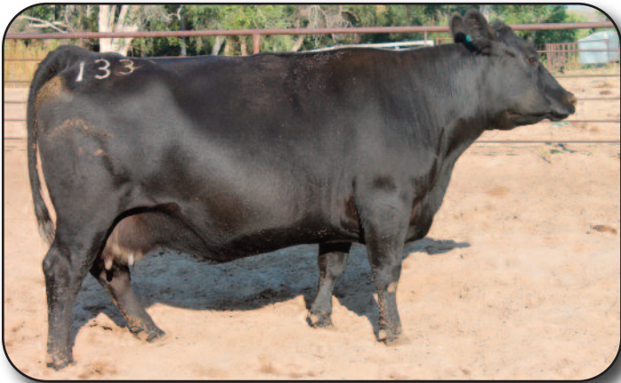
Donor Dam • MSAR GD Blackcap 133

Progeny are lots: 6-12, 62, 64, 133 & 134.