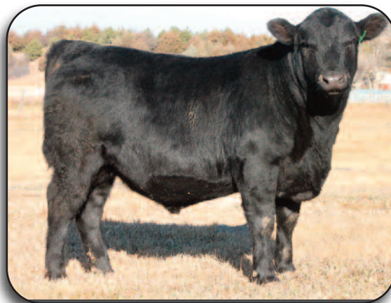
LOT 117 - Simonson Cash 1267

SITZ UPWARD 307R MSAR BLACKCAP 271 MSAR BLACKCAP 771 CONNEALY ONWARD SITZ HENRIETTA PRIDE 81M LEACHMAN RIGHT TIME MSAR BLACKCAP 971