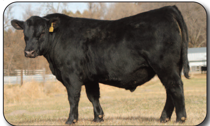
LOT 57 - TM MSAR Hot Lotto 3577