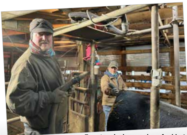
Top steer jockeys and are for hire!