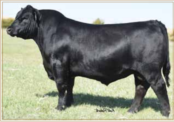
Jindra Blackout - Reference Sire