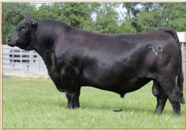
Deer Valley Growth Fund - Reference Sire