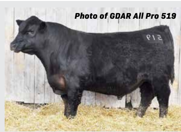
Photo of GDAR All Pro 519