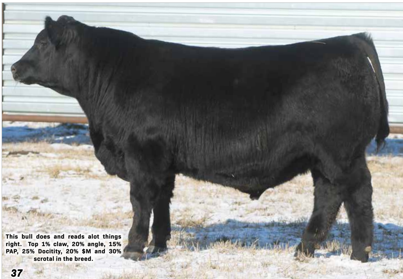
This bull does and reads alot things right. Top 1% claw, 20% angle, 15% PAP, 25% Docitivity, 20% $M and 30% scrotal in the breed.